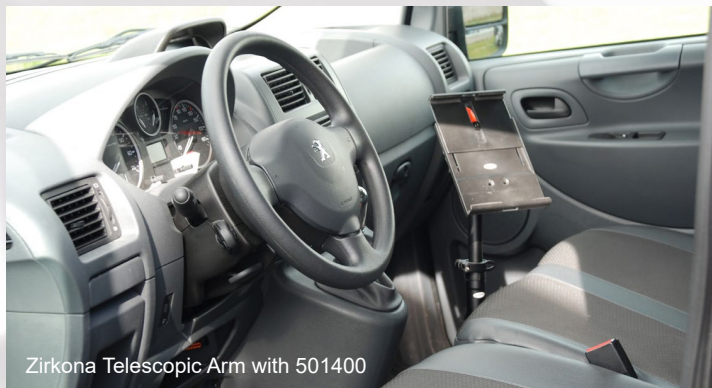
Zirkona Telescopic Arm with 501400