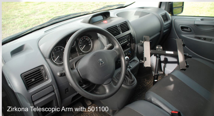
Zirkona Telescopic Arm with 501100