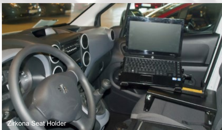
Zirkona Seat Holder