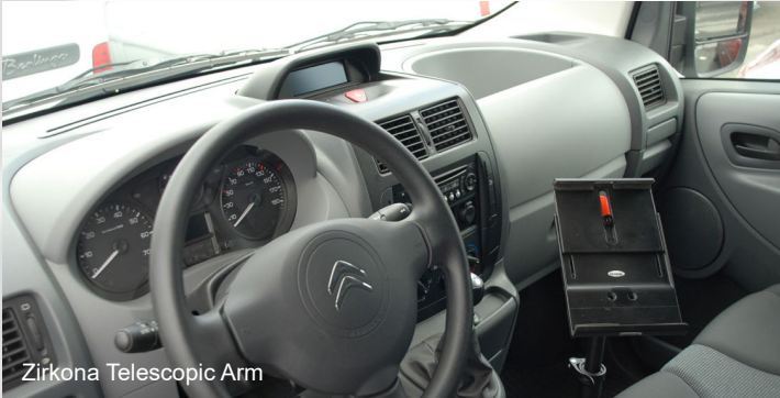
Zirkona Telescopic Arm