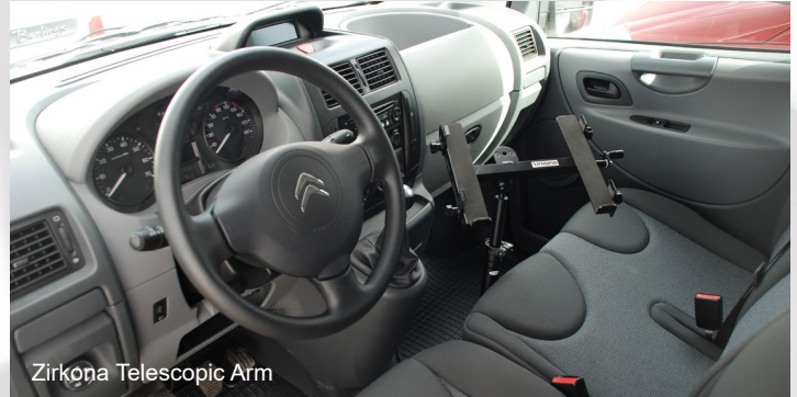
Zirkona Telescopic Arm